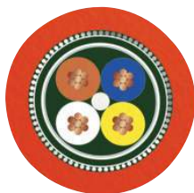
Sercos III [93K]