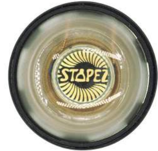
1:1 size in A4 paper