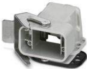
Box mounting base with single locking engagement nose for HC-COM-K-KV-PG16... screw connection, box mounting base is opened from below.

Please be informed that the data shown in this PDF Document is generated from our Online Catalog. Please find the complete data in the user's documentation. Our General Terms of Use for Downloads are valid ( http://download.phoenixcontact.com )