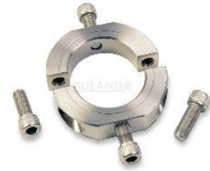
*Additional hardware NOT included