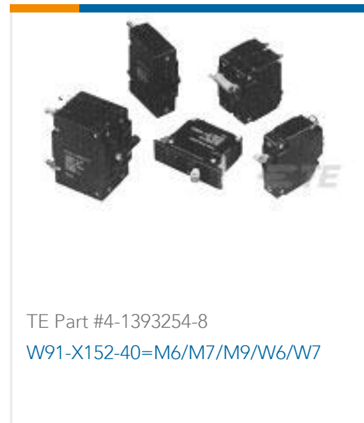
TE Part #4-1393254-8 W91-X152-40=M6/M7/M9/W6/W7