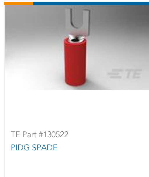
TE Part #130522 PIDG SPADE