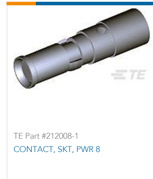
TE Part #212008-1 CONTACT, SKT, PWR 8