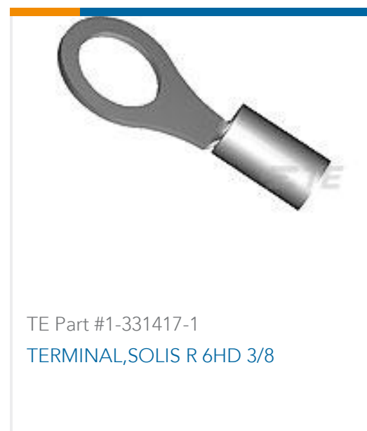
TE Part #1-331417-1 TERMINAL,SOLIS R 6HD 3/8