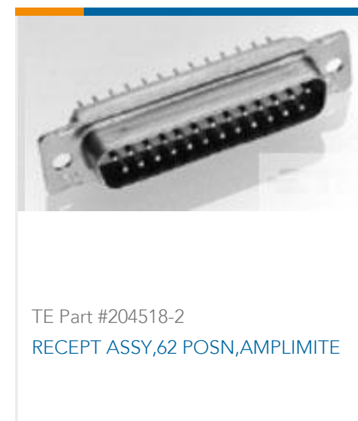
TE Part #204518-2 RECEPT ASSY,62 POSN,AMPLIMITE