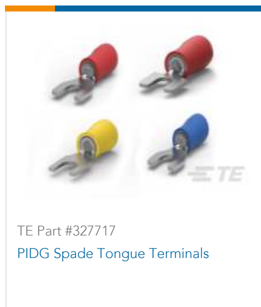
TE Part #327717 PIDG Spade Tongue Terminals