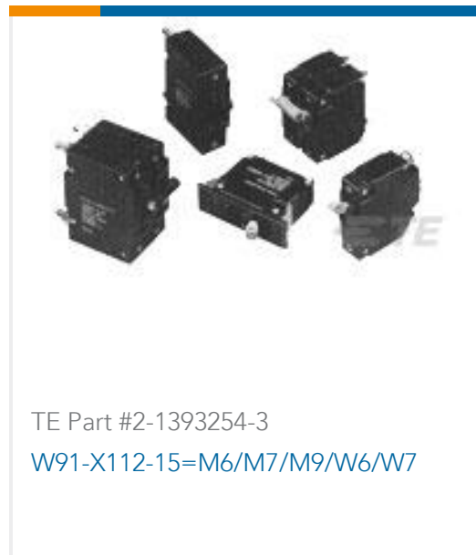
TE Part #2-1393254-3 W91-X112-15=M6/M7/M9/W6/W7