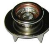
CS1010 - Female Socket