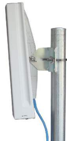
EZ-Bridge-LT™ tool-less installation