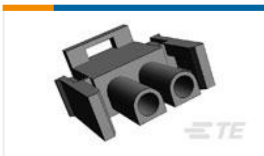
TE Part #1-480698-0 02P UMNL PLUG HSG NATL