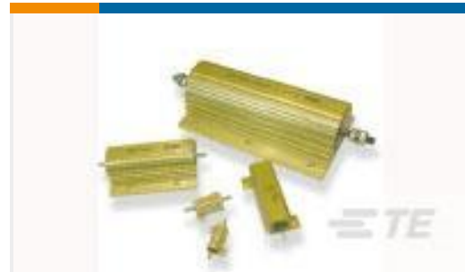
TE Part #2-1630027-7 HSC300 8R0 5%