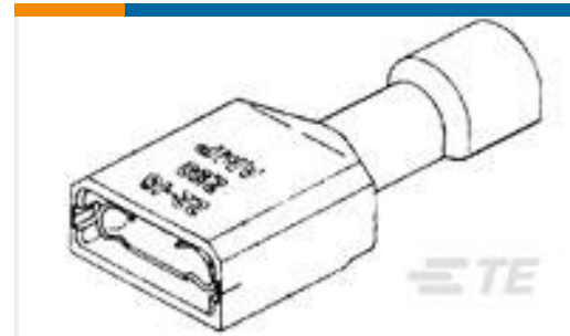
TE Part #3-350820-2 ULTRAFAST 250 ASSY REC 16-14 TPBR LP