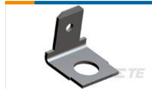
TE Part #61407-3 187 FASTON TPBR