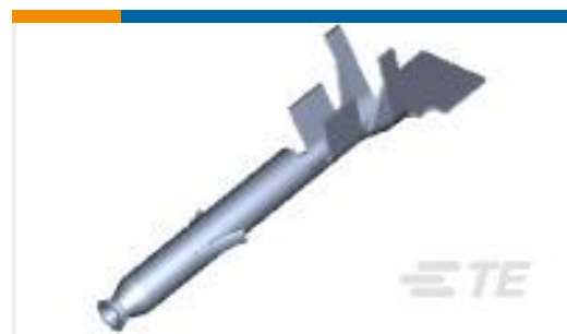
TE Part #770904-1 MINI UMNL SOK 22-18 AWG SN