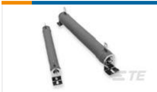
TE Part #1879453-7 TE 1000W 3R3 5% Bracket