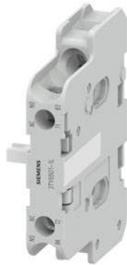
2nd auxiliary switch block on the right, for 3TB46...3TB50