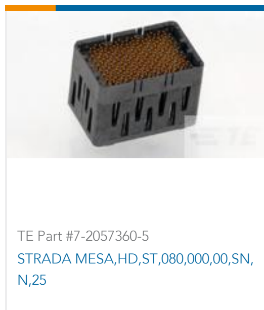
TE Part #7-2057360-5 STRADA MESA,HD,ST,080,000,00,SN, N,25