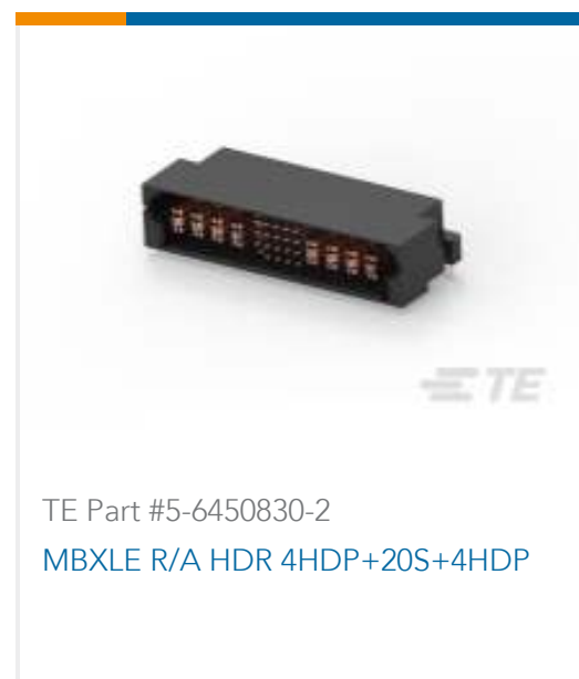
TE Part #5-6450830-2 MBXLE R/A HDR 4HDP+20S+4HDP