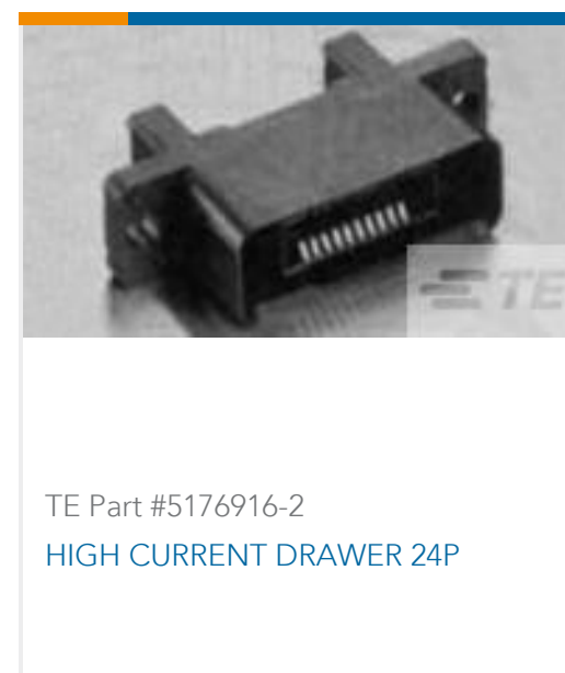
TE Part #5176916-2 HIGH CURRENT DRAWER 24P