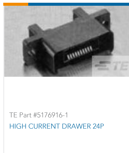
TE Part #5176916-1 HIGH CURRENT DRAWER 24P