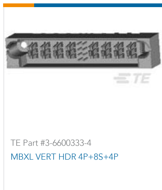
TE Part #3-6600333-4 MBXL VERT HDR 4P+8S+4P