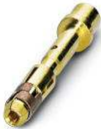
Crimp contact, turned, Single contact, Contact diameter: 1 mm, Crimp range: 0.25 mm 2 ...1 mm 2

Please be informed that the data shown in this PDF Document is generated from our Online Catalog. Please find the complete data in the user's documentation. Our General Terms of Use for Downloads are valid ( http://download.phoenixcontact.com )