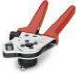
Crimping pliers with digital display

Crimping pliers with digital display - SF-Z0025 - 1607452