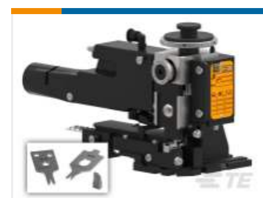
TE Part # 7-2151077-2 OCEAN_2.0_Applicator-S-070F110F