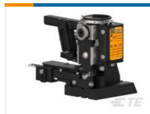
TE Part # 2-2151077-1 OCEAN_2.0_Applicator-S-070F110F