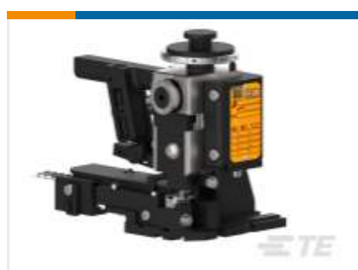
TE Part # 2151077-1 OCEAN_2.0_Applicator-S-070F110F