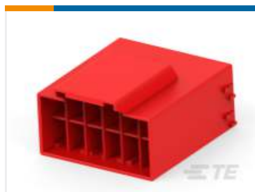
TE Part # 1-2357096-2 GRACE INERTIA 3.5W CAP 12P RED