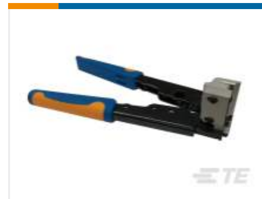
TE Part # 2305570-1 Strip Terminal Cutter-Side Feed-No Crimp