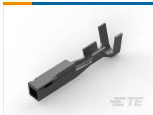
TE Part # CAT-G7534-R2435 GRACE INERTIA Receptacle