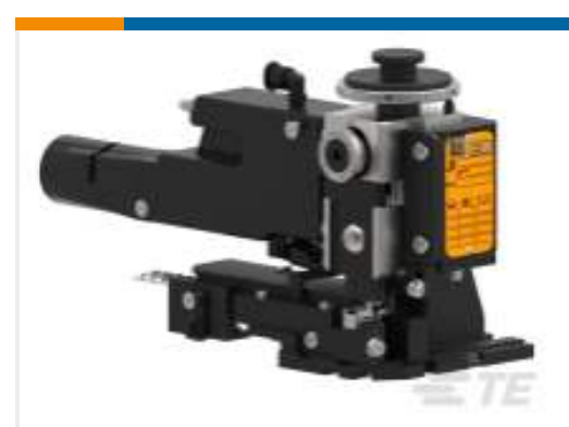
TE Part # 2151077-2 OCEAN_2.0_Applicator-S-070F110F