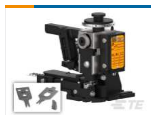
TE Part # 7-2151077-1 OCEAN_2.0_Applicator-S-070F110F