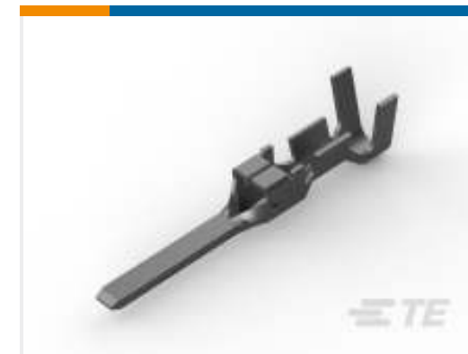
TE Part # 1612335-1 GRACE INERTIA 3.5 TAB CONTACT (M)