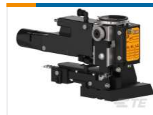
TE Part # 2-2151077-2 OCEAN_2.0_Applicator-S-070F110F