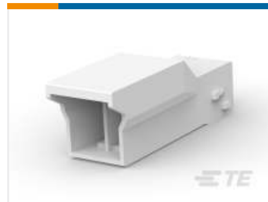
TE Part # CAT-G7534-C1701 STD Temp GRACE INERTIA Cap