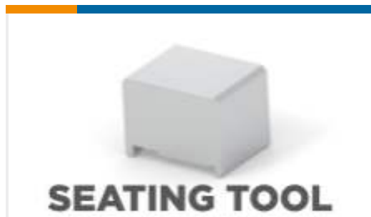
TE Part # 2018513-1 TL, SEAT 4 PR 16 COL BP CONN