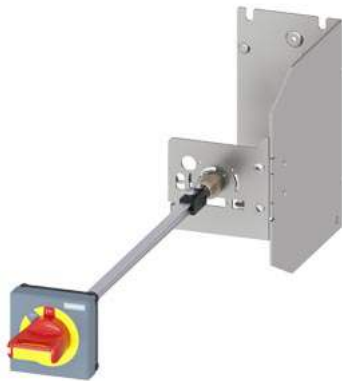
door-coupling rotary operating mechanism for harsh conditions for circuit breaker size S2 handle EMERGENCY OFF