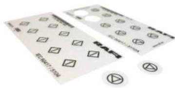
Printed labeling sheet