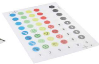
Labeling sheet with separate print and colors available on request