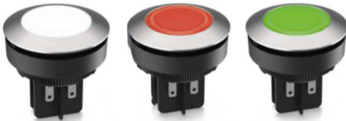
White (neutral) Non-illuminated