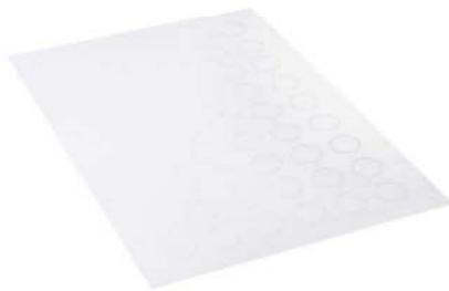
Unprinted labeling sheet

Legend inserts are available for legending pushbuttons. With the "FLEXLAB" labeling sheet, individual legending can be created using an inkjet printer. In addition, a WORD document is available to download as a template. The legend inserts are pre-cut and can be separated from the sheet individually.