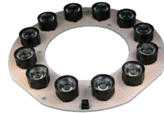
OPA741_ (23° Beam Angle)