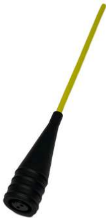
CMCP602HST Push On IP68 Connector