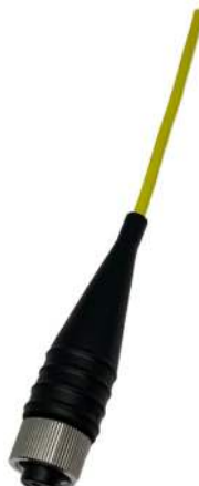
CMCP602H IP68 Locking Collar