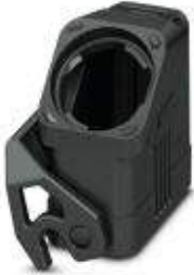
HEAVYCON EVO coupling housing, plastic, with bayonet flange for EVO screw connection, D15, with single locking latch, without EVO screw connection

Please be informed that the data shown in this PDF Document is generated from our Online Catalog. Please find the complete data in the user's documentation. Our General Terms of Use for Downloads are valid ( http://phoenixcontact.com/download )