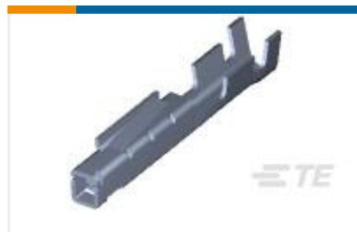
TE Part #1318107-1 DYNAMIC D-2000 REC CONT M L/P