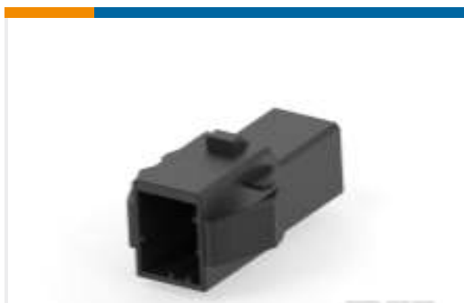
TE Part #1-1318114-6 Receptacle and Tab Housing: 2.5 mm Pitch, 250V