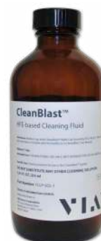
FCLP-SOL1 7.61 oz / 225ml