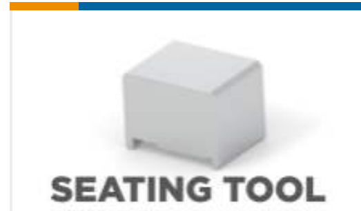
TE Part # 2018377-1 TOOL, SEAT 3 PR 10 COL, BP CONN