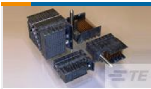
TE Part #2007705-1 IMP100S,R,RA3P10C,UG,39