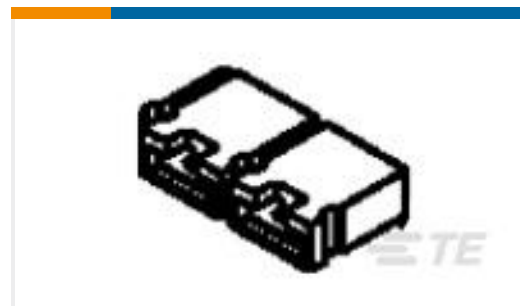
TE Part #827914-1 2P SHUNTSTECKER