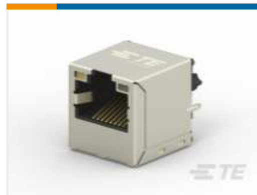
TE Part #2301995-4 RJ45 JACK INT.MAG. 1GB LED 1X1 VERT.