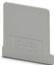
End cover, Length: 42.5 mm, Width: 1.3 mm, Color: gray

Please be informed that the data shown in this PDF Document is generated from our Online Catalog. Please find the complete data in the user's documentation. Our General Terms of Use for Downloads are valid ( http://download.phoenixcontact.com )