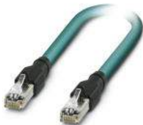
Patch cable, CAT5e, 4-pair, shielded, line, assembled at both ends with straight RJ45/IP20 heads, length: 5 m

Please be informed that the data shown in this PDF Document is generated from our Online Catalog. Please find the complete data in the user's documentation. Our General Terms of Use for Downloads are valid ( http://download.phoenixcontact.com )