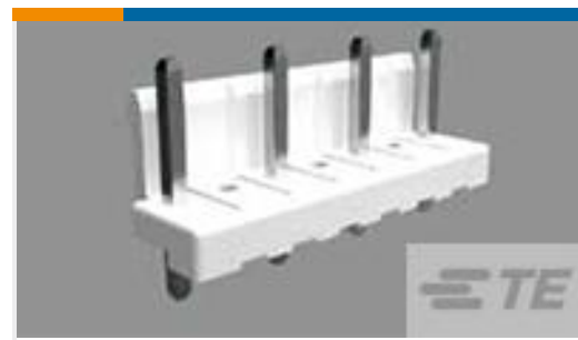
TE Part #1-1318301-2 3.96EP HDR ASSY 2(3)P NAT/TUBE