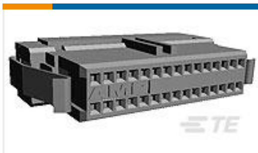
TE Part #2-111196-2 60 RCPT SYSTEM 50, LEAD FREE