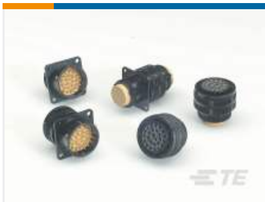
TE Part #ZPF00000000018732 FDBA 50H 14-19 PN-K-A276A