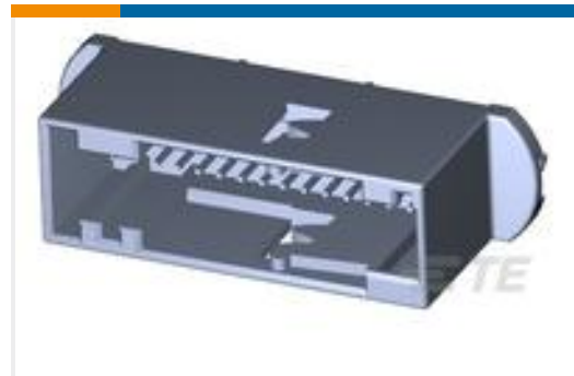
TE Part #2-966658-2 32pos MQS .63 header 180deg