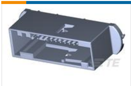
TE Part #3-966658-1 32pos MQS .63 header 180deg