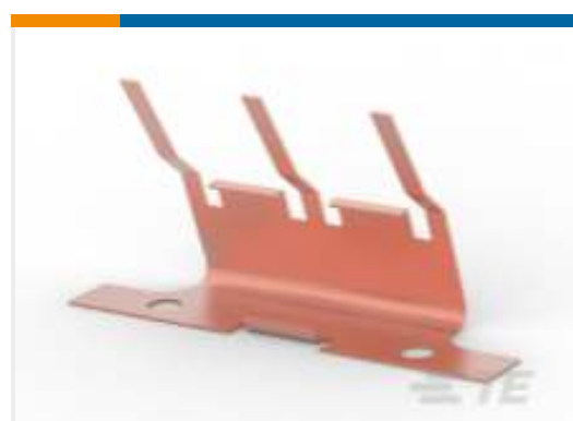
TE Part #2196135-1 C LEAF SPRING