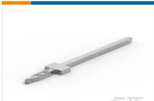
TE Part #1-1743447-2 PRESS FIT PIN TERMINALS