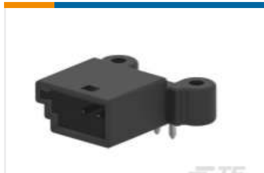
TE Part #936166-2 Signal Header