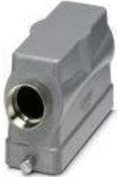
HEAVYCON sleeve housing B24, for single locking latch, height 76 mm, with support 1x M32, lateral conductor exit

Please be informed that the data shown in this PDF Document is generated from our Online Catalog. Please find the complete data in the user's documentation. Our General Terms of Use for Downloads are valid ( http://download.phoenixcontact.com )