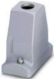
HEAVYCON ADVANCE EMV sleeve housing B10, with screw locking, height 100 mm, with 1x M25 thread, straight cable outlet

Please be informed that the data shown in this PDF Document is generated from our Online Catalog. Please find the complete data in the user's documentation. Our General Terms of Use for Downloads are valid ( http://download.phoenixcontact.com )