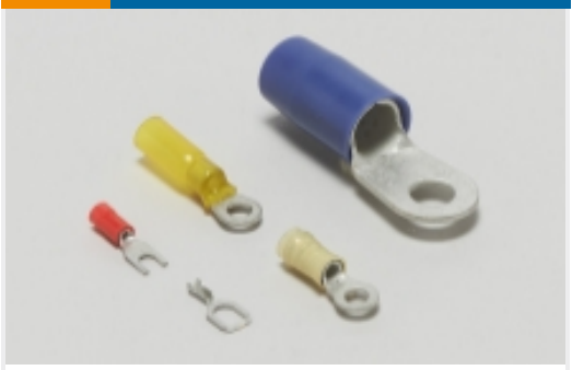
Ring Terminals & Spade Terminals(861)