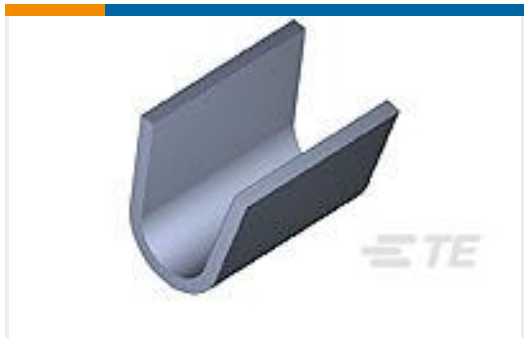
TE Part #63130-3 SPLICE REC. 1500-5000 .020 TPBR