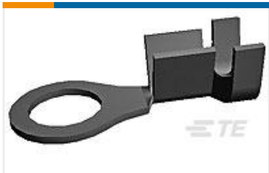
TE Part #61863-2 RING CRIMP 18-14 AWG TPBR