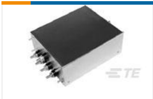
TE Part #6609073-1 20AYT6C J0=F7474