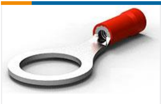
TE Part #34152 PG R 22-16 COMM 22-18 MIL 3/8