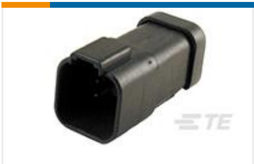
TE Part #DT04-6P-EP13 REC, 6P, BLK, BUSBAR 1X6, NICKEL