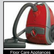
Floor Care Appliances