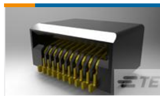
TE Part #2170088-2 ZSFP+ Connector, 15u"