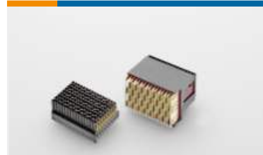
TE Part #2332816-1 RA Plug Assy Left End Multigig RT 3