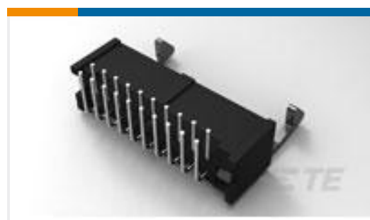
TE Part #1761607-3 IDC LOW PRO HDR 10P RA LG LAT