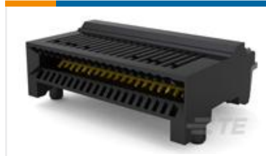
TE Part #1551920-2 zQSFP+ connector assembly