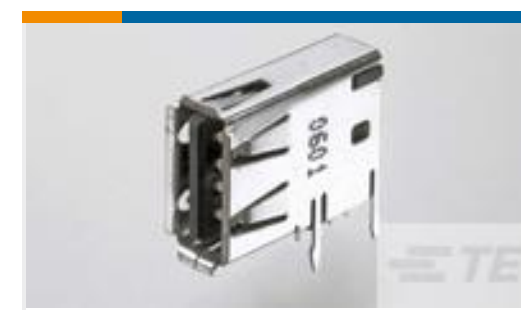
TE Part #292336-1 Std USB Type A, Flag, T/H