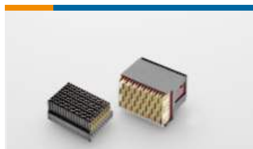
TE Part #2302785-1 RA PLUG ASSY, 7ROW, CENTER, VPX, MG RT3