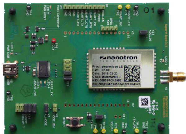
swarm bee LE V2 DK Plus Board

The swarm bee Development Kit Plus (DK+) is a useful tool for users to get quick acquaintance with the basic functionality of swarm bee LE. The Development Kit Plus consists of several DK+ Boards (see figure below) with antenna, swarm PC Tool which demonstrates ranging application, sensor monitor as well as to use the API via GUI and sniffer which allows to monitor the air interface.