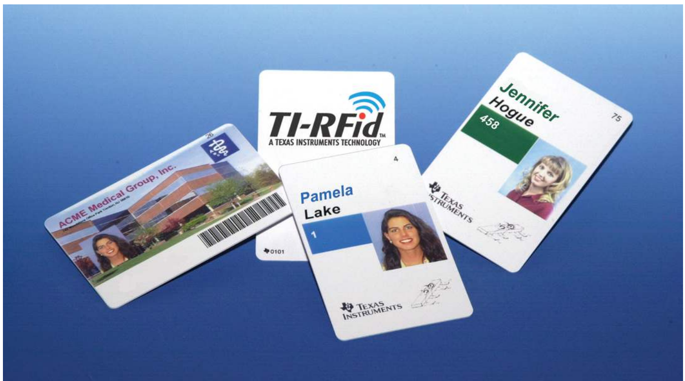
TI-RFid 13.56 MHz Vicinity badges (print examples)