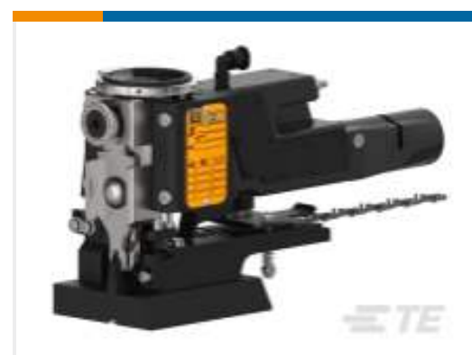
TE Part # 2-2150069-2 OCEAN_2.0_Applicator-E-120F180F