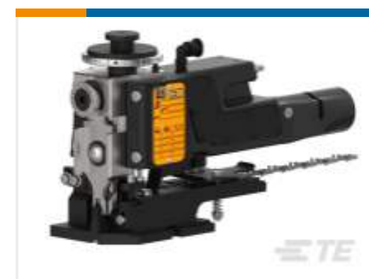
TE Part # 2150069-2 OCEAN_2.0_Applicator-E-120F180F