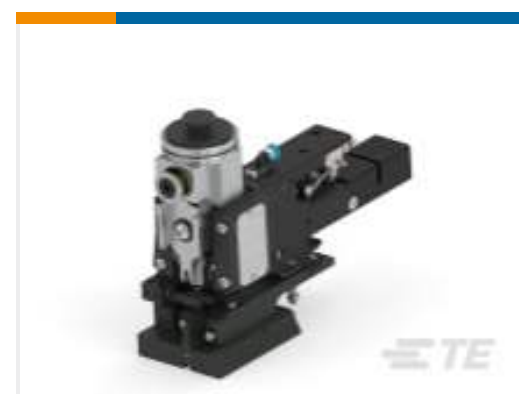
TE Part # 2150069-1 OCEAN_2.0_Applicator-E-120F180F