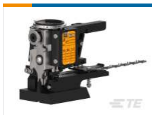
TE Part # 2-2150069-1 OCEAN_2.0_Applicator-E-120F180F