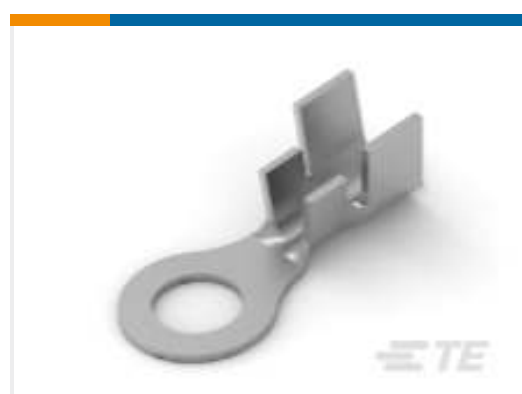
TE Part # 41332-5 RING 18-14 AWG TPBR