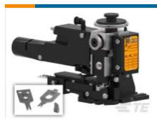
TE Part # 7-2150069-2 OCEAN_2.0_Applicator-E-120F180F