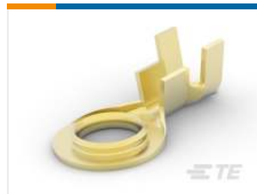
TE Part # 60546-1 EXTRUDED RING CRIMP 18-14 AWG BR