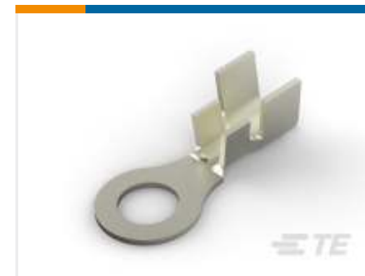
TE Part # 41332-1 RING TERMINAL 18-14 AWG NPST