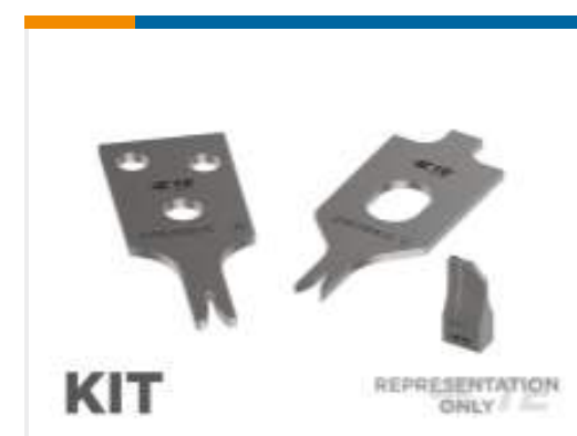
TE Part # 7-2150069-7 OCEAN_2.0_SPARE_PART_KIT-120F180F