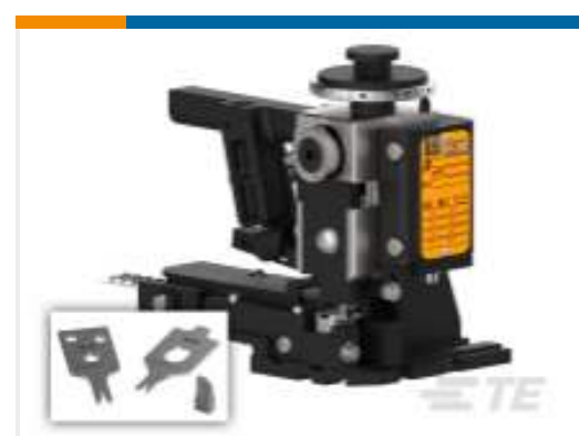
TE Part # 7-2150069-1 OCEAN_2.0_Applicator-E-120F180F