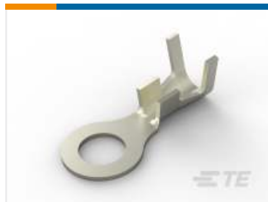
TE Part # 485003-1 RING 22-18 AWG 0.0195 X 0.5 NPST