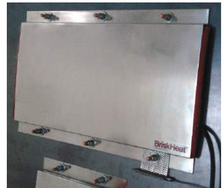
Metal-Clad Hopper Heater