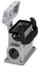
HEAVYCON box mounting base B6, with single locking latch and cover, height 74 mm, with support 2xM32

Please be informed that the data shown in this PDF Document is generated from our Online Catalog. Please find the complete data in the user's documentation. Our General Terms of Use for Downloads are valid ( http://phoenixcontact.com/download )