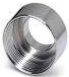
Step-up adapter, M32 to M40, including O-ring

Extension adapter - ENLAR-M-KV-M32/M40 - 1647682