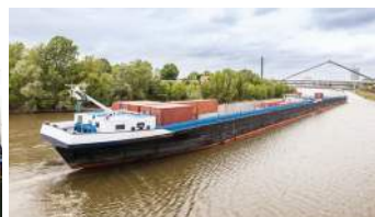
SHIP POWER SYSTEMS