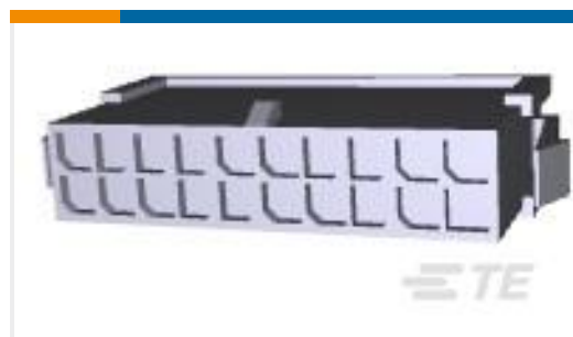
TE Part #2-794615-0 PANEL MT DBL ROW HSG 20 POS