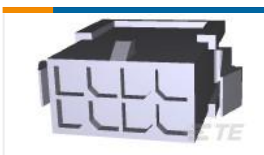
TE Part #794615-8 PANEL MT DBL ROW HSG 8 POS