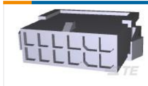
TE Part #1-794615-2 PANEL MT DBL ROW HSG 12 POS