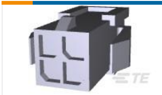
TE Part #794615-4 PANEL MT DBL ROW HSG 4 POS