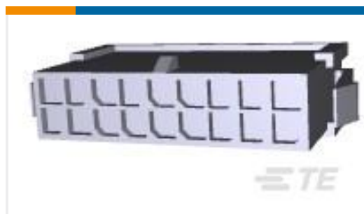
TE Part #1-794615-8 PANEL MT DBL ROW HSG 18 POS