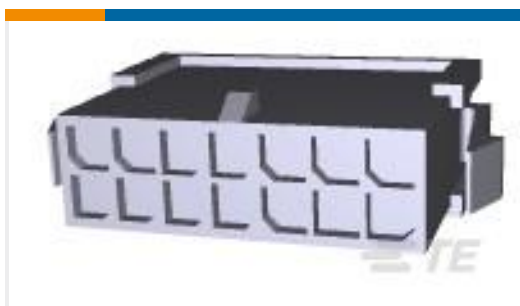
TE Part #1-794615-4 PANEL MT DBL ROW HSG 14 POS