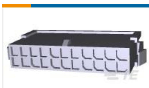
TE Part #2-794615-2 PANEL MT DBL ROW HSG 22 POS