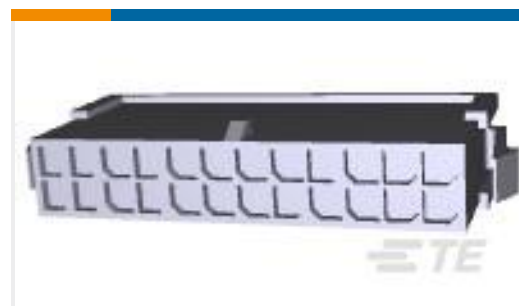
TE Part #2-794615-4 PANEL MT DBL ROW HSG 24 POS