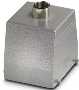
Photo shows sleeve housing with support

http://eshop.phoenixcontact.de/phoenix/treeViewClick.do?UID=1647307