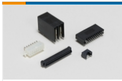
Standard Rectangular Connectors(18)