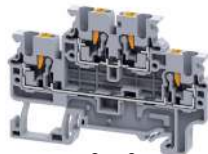
Double Level Terminal Jumpers / Marking on both levels