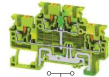
4 Connection Ground Terminal