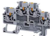
Double Level Terminal Internally Shorted