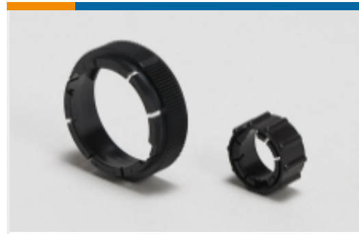
Circular Connector Adapters(7)