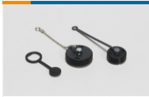
Circular Connector Caps & Covers(16)