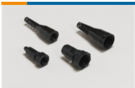
Connector Strain Relief(6)