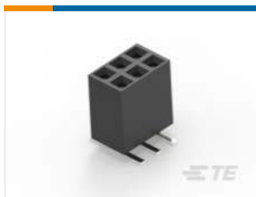
TE Part #2271646-6 AMPMODU, REC, 2.54, DR, SMT, 9.90 H, 6POS