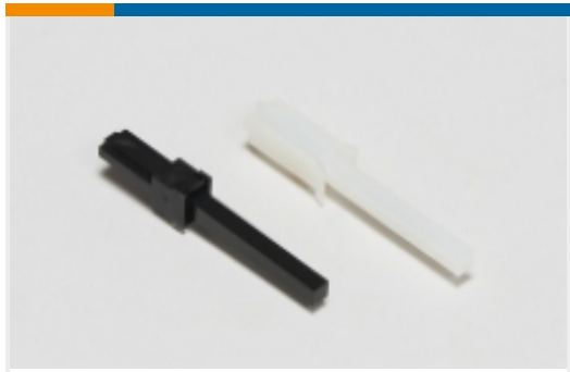
Circular Connector Keying Plugs(2)