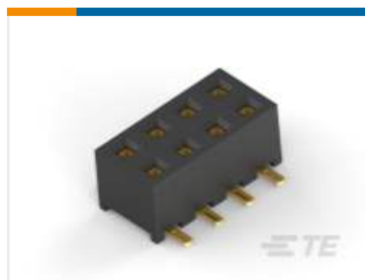
TE Part #2271597-8 AMPMODU, REC HDR,DR, 2.0PITCH, SMT, 8P