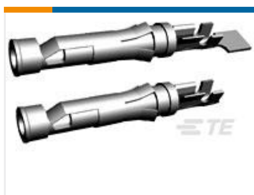
TE Part #66109-4 III+ SKT,26-24,30AU/FL,LP