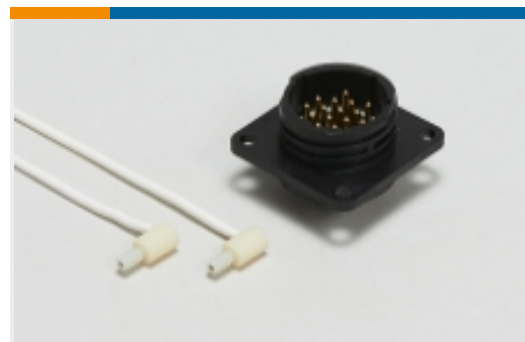
Circular Power Connectors(459)