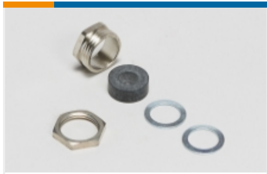
Circular Connector Hardware(3)