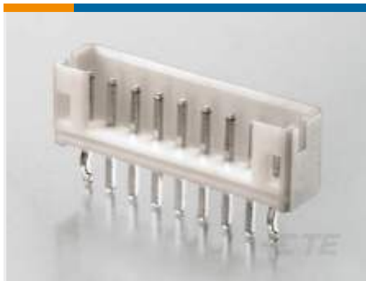
TE Part #440052-2 AMP HPI 2.5 mm Headers