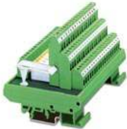
VARIOFACE module, for mounting on NS 35/7.5 or NS 32, for connecting 8 proximity switches

Please be informed that the data shown in this PDF Document is generated from our Online Catalog. Please find the complete data in the user's documentation. Our General Terms of Use for Downloads are valid ( http://phoenixcontact.com/download )