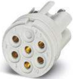
Contact insert, Number of positions: 6, Type of contact: Socket, Screw connection

Please be informed that the data shown in this PDF Document is generated from our Online Catalog. Please find the complete data in the user's documentation. Our General Terms of Use for Downloads are valid ( http://phoenixcontact.com/download )