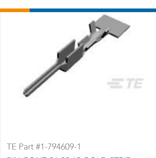
PIN CONT 26-30 15 GOLD STRIP