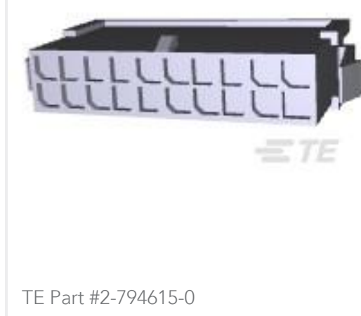
PANEL MT DBL ROW HSG 20 POS