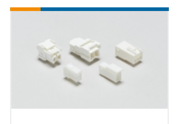
Rectangular Power Connectors(479)