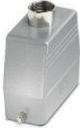
Sleeve housing, for single locking latch, height 65 mm, without screw connection, 1x Pg21, straight cable entry

Please be informed that the data shown in this PDF Document is generated from our Online Catalog. Please find the complete data in the user's documentation. Our General Terms of Use for Downloads are valid ( http://download.phoenixcontact.com )