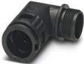
Cable gland, metric thread, IP66 protection, angled

Please be informed that the data shown in this PDF Document is generated from our Online Catalog. Please find the complete data in the user's documentation. Our General Terms of Use for Downloads are valid ( http://phoenixcontact.com/download )