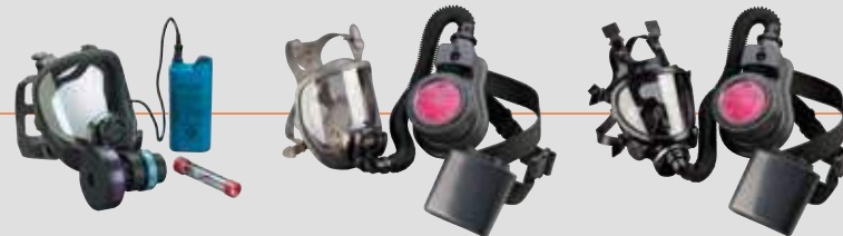
Face-mounted PAPR † (available for 6000 FF only)