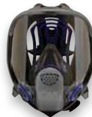
Ultimate FX FF-400