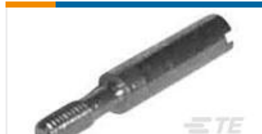
TE Part #1-1106100-1 SPB-M3