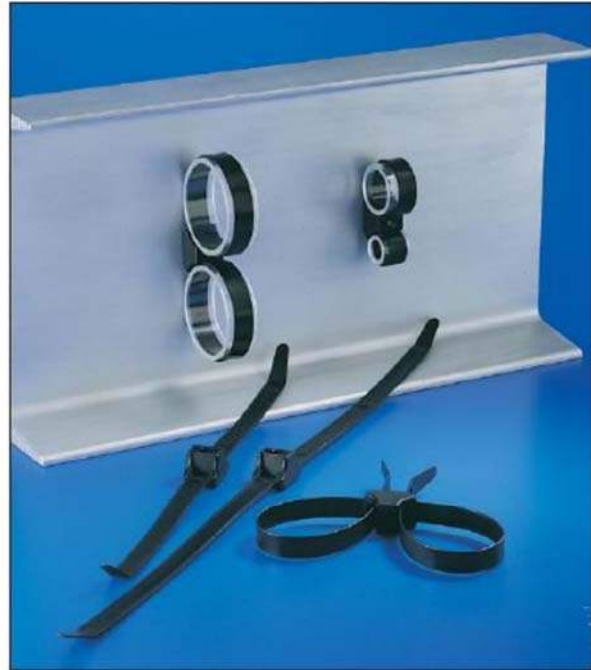
U.S. Patent Number 5,966,781

Available in two lengths, the dual clamp ties accommodate bundles ranging from .25 inches to 2.3 inches. The flexible wide straps minimize pinching of hoses and convoluted tubing. The straps are also releasable.